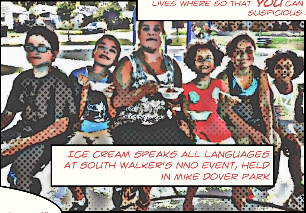
ICE CREAM SPEAKS ALL LANGUAGES AT SOUTH WALKER'S NNO EVENT, HELD IN MIKE DOVER PARK