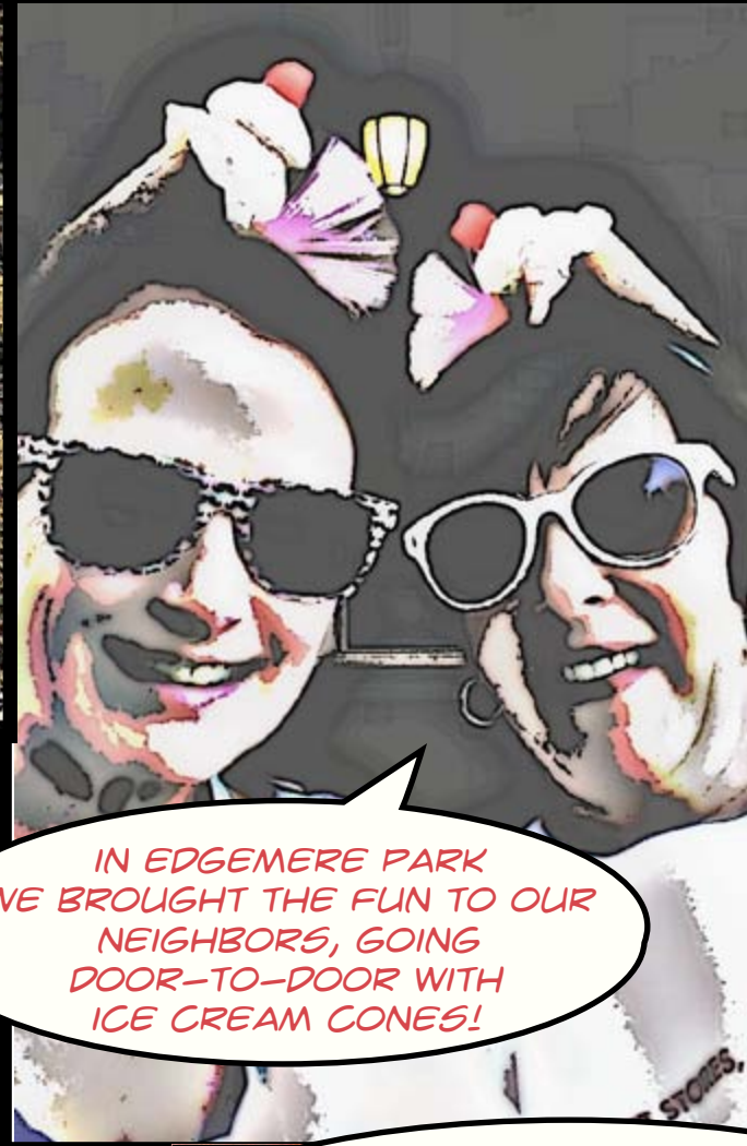
IN EDMERE PARK WE BROUGHT THE FUN TO OUR NEIGHBORS, GOING DOOR-TO-DOOR WITH ICE CREAM CONES!