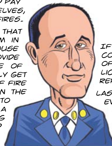
OKC FIRE CHIEF KEITH BRYANT

THIS IS ALSO THE TIME OF YEAR WHEN YOU SHOULD CHECK THE HEATING EQUIPMENT IN YOUR HOME. GAS OR ELECTRIC FURNACES AND ESPECIALLY SPACE HEATERS SHOULD BE THOROUGHLY CHECKED FOR PROPER OPERATION AND CONDITION PRIOR TO USE.