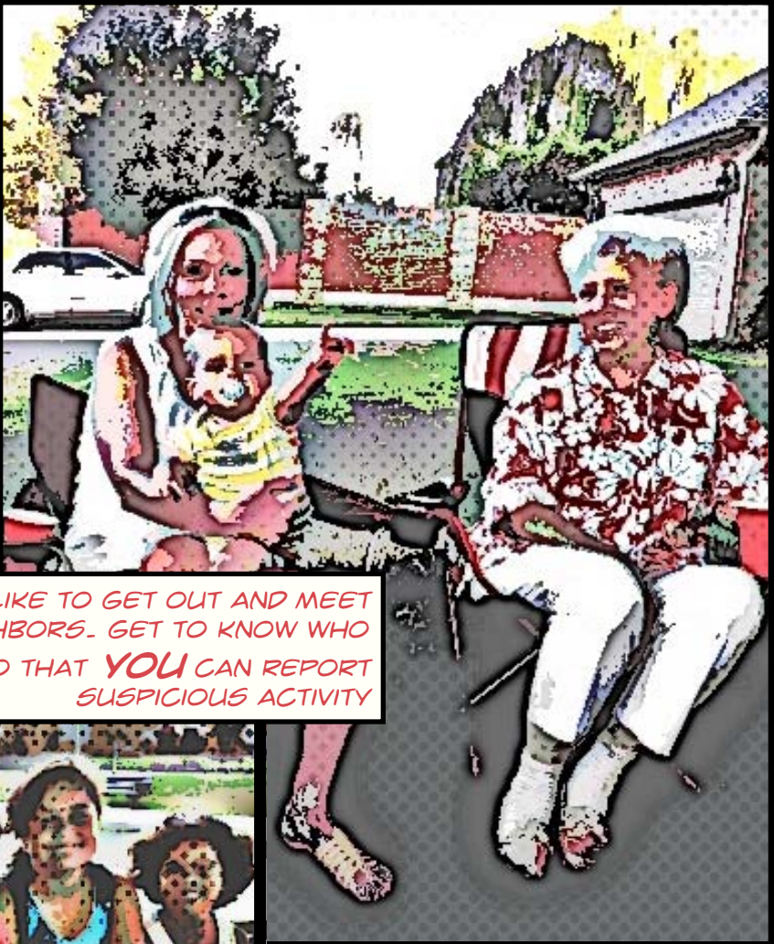
ALL AGES LIKE TO GET OUT AND MEET THEIR NEIGHBORS. GET TO KNOW WHO LIVES WHERE SO THAT YOU CAN REPORT SUSPICIOUS ACTIVITY