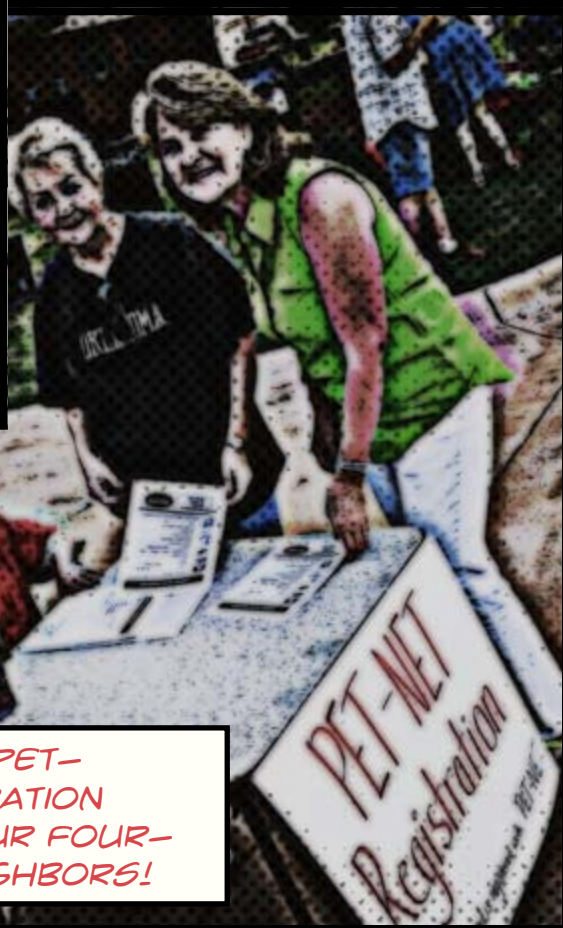
LAKEVIEW'S PET-NET REGISTRATION INCLUDED OUR FOUR-LEGGED NEIGHBORS!