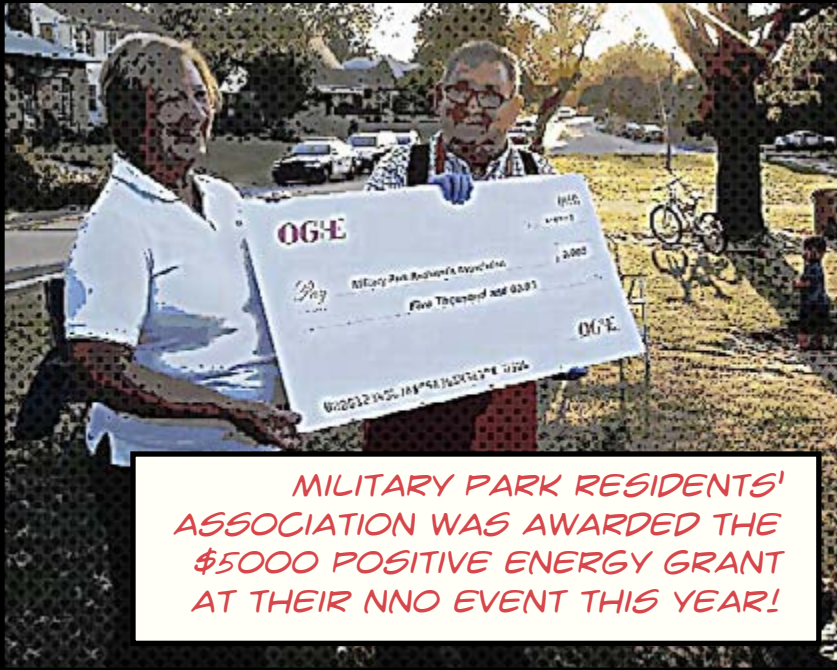
MILITARY PARK RESIDENTS' ASSOCIATION WAS AWARDED THE $5000 POSITIVE ENERGY GRANT AT THEIR NNO EVENT THIS YEAR!