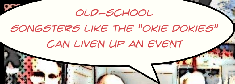
OLD-SCHOOL SONGSTERS LIKE THE "OKIE DOKIES" CAN LIVEN UP AN EVENT